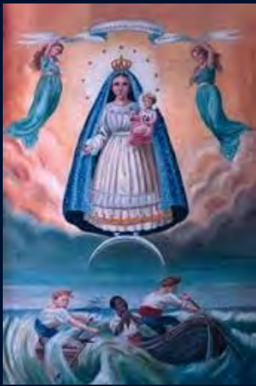
Our Lady of Charity