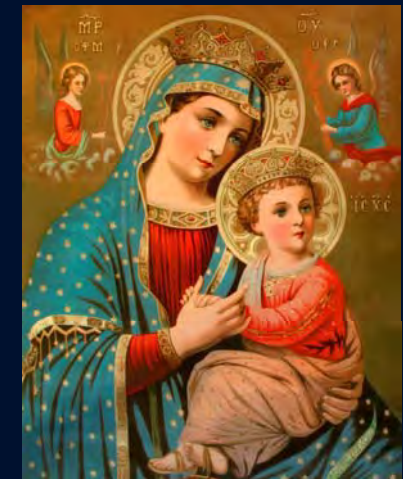
Our Lady of Perpetual Help