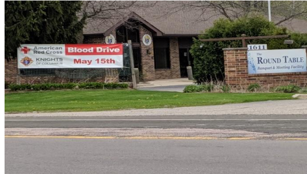
Council 4897 Sun Prairie COVID blood drive