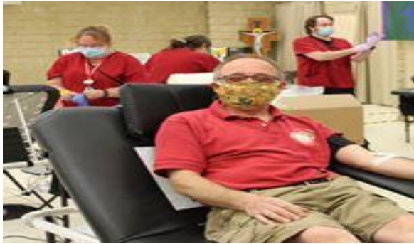
Council 1762 blood donations