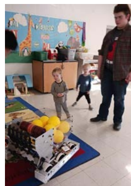
Kids watching the robots.