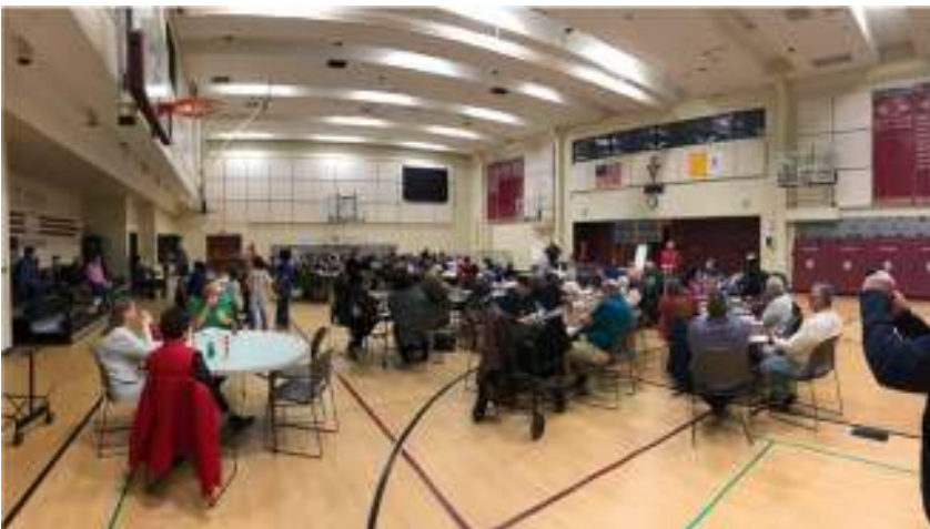
Bingo at its best! The gym was filled like the 'good ol' days'...