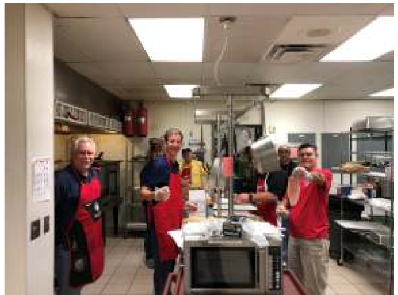
The kitchen crew serving with humility and much joy!