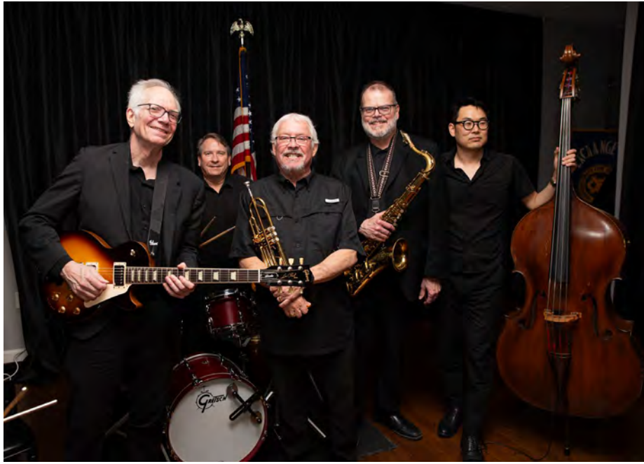
Jazz ensemble entertained the attendees for the evening.