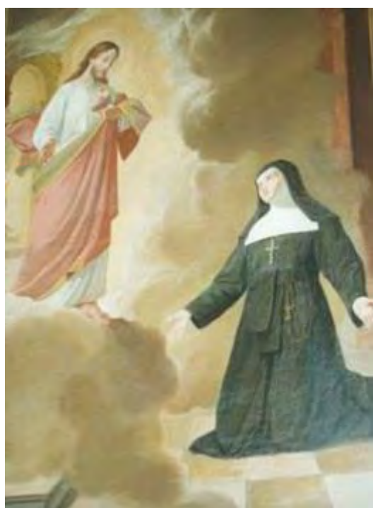
The Sacred Heart appearing to Saint Margaret Mary Alacoque .

We ask that you wear your knight's badge and/or clothing to show your unity and support. After Mass, all are welcome to join in fellowship for breakfast at the McDonald's located on the northwest corner of Spring Creek Pkwy and Independence Pkwy.