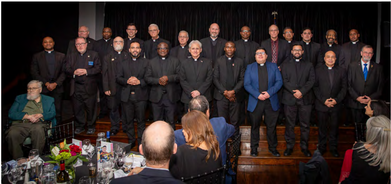
Clergy for the Diocese of Dallas recognized for their service.