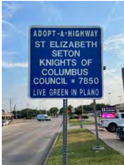
Sign location on northeast corner of Custer Road at intersection with Parker Road.

Plano's Adopt-A-Highway (AAH) Program provides local homeowner associations, businesses, civic organizations, churches and schools the opportunity to make an impact on the cleanliness and appearance of our community. By accepting the responsibility and leadership of the assigned roadway, the group is not only increasing awareness of litter issues and the impact of beautification efforts but also demonstrating a positive behavior of local pride and ownership of Plano.