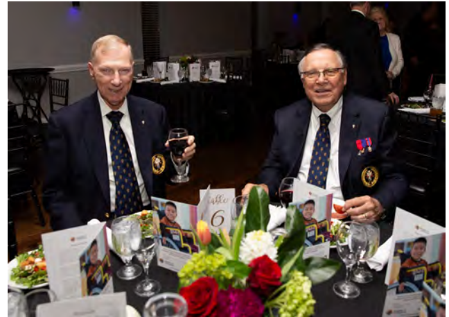
Dinner is served.