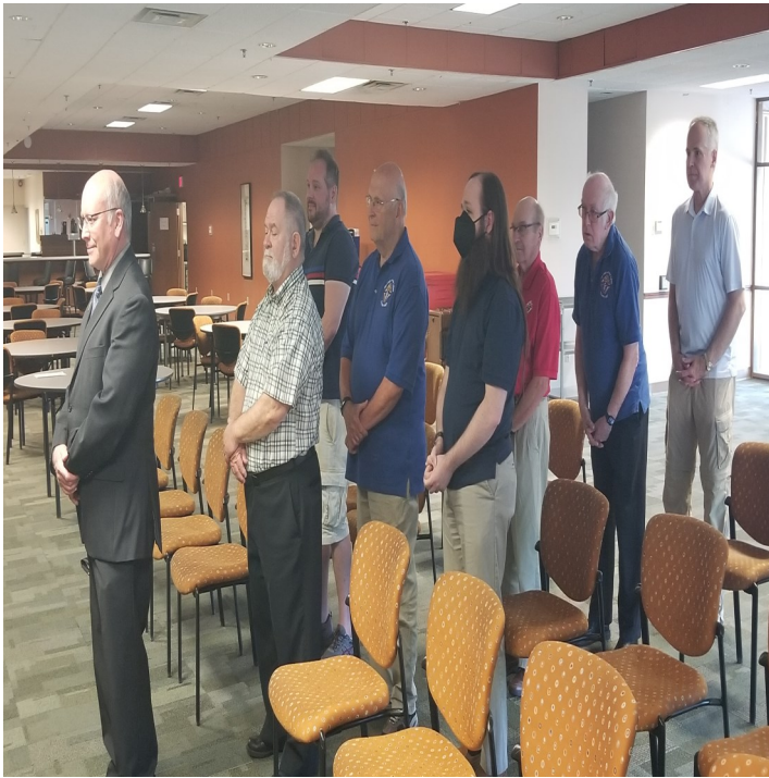
INSTALLATION OF THE 2023 2024 OFFICERS