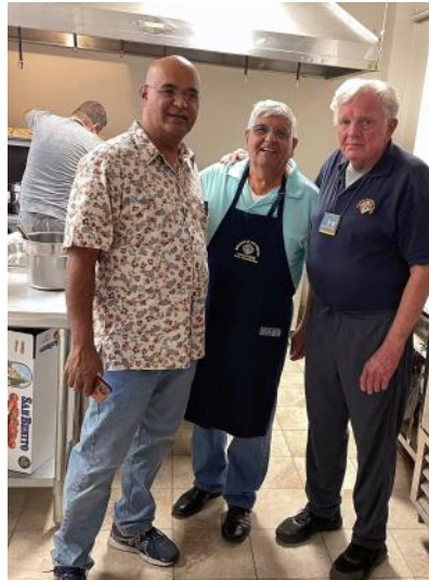
Pasta Dinner, Friday August 26th