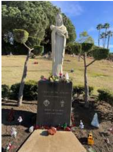
Shrine of Unborn