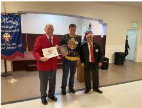
Father Hawe Assembly 4th Degree Christmas Party and 100 th Anniversary Celebration