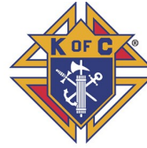
Merciful Jesus Council #17519 Madison, AL

FREE online membership continues! If you know of anyone interested in joining our award winning Council, they can use the code BLESSEDMCGIVNEY when visiting the website link HERE .