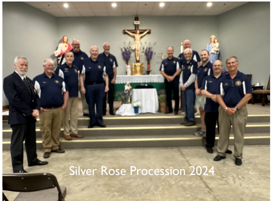
Silver Rose Procession 2024