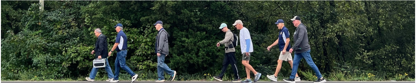
Silver Rose Transfer 2024