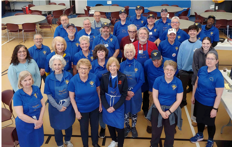
Many, but not all, of our wonderful volunteers

time, with most attendees staying 90 minutes or more at each event.