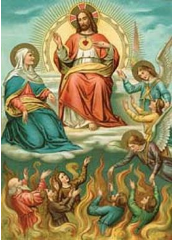
© 2020 Missionaries of the Holy Family.