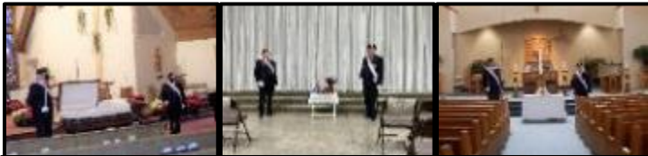
Become an Honor Guard for Funeral Masses and Visitations