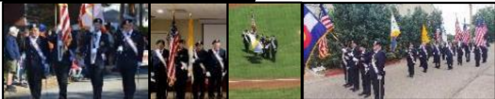
Become a Color Guard for Civic and Public Events