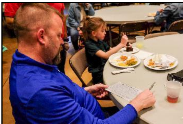
Prospective Knight signs up