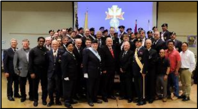
4th Degree Exemplification, 14 Jun 25, Madison, Alabama (Color Guard Team with New Sir Knights & Dignitaries)

April 2 - Holy Thursday Mass at SJB Catholic Parish. Time TBD