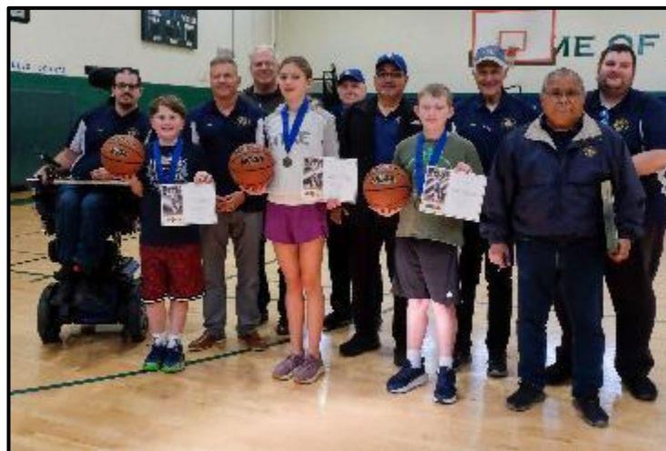
Winners with Supporting Knights