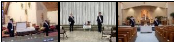
Become an Honor Guard for Funeral Masses and Visitations