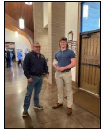
On 17-18 January 13 Knights participated in the quarterly membership drive. Their efforts recruited 4 new members. Good work, brothers!