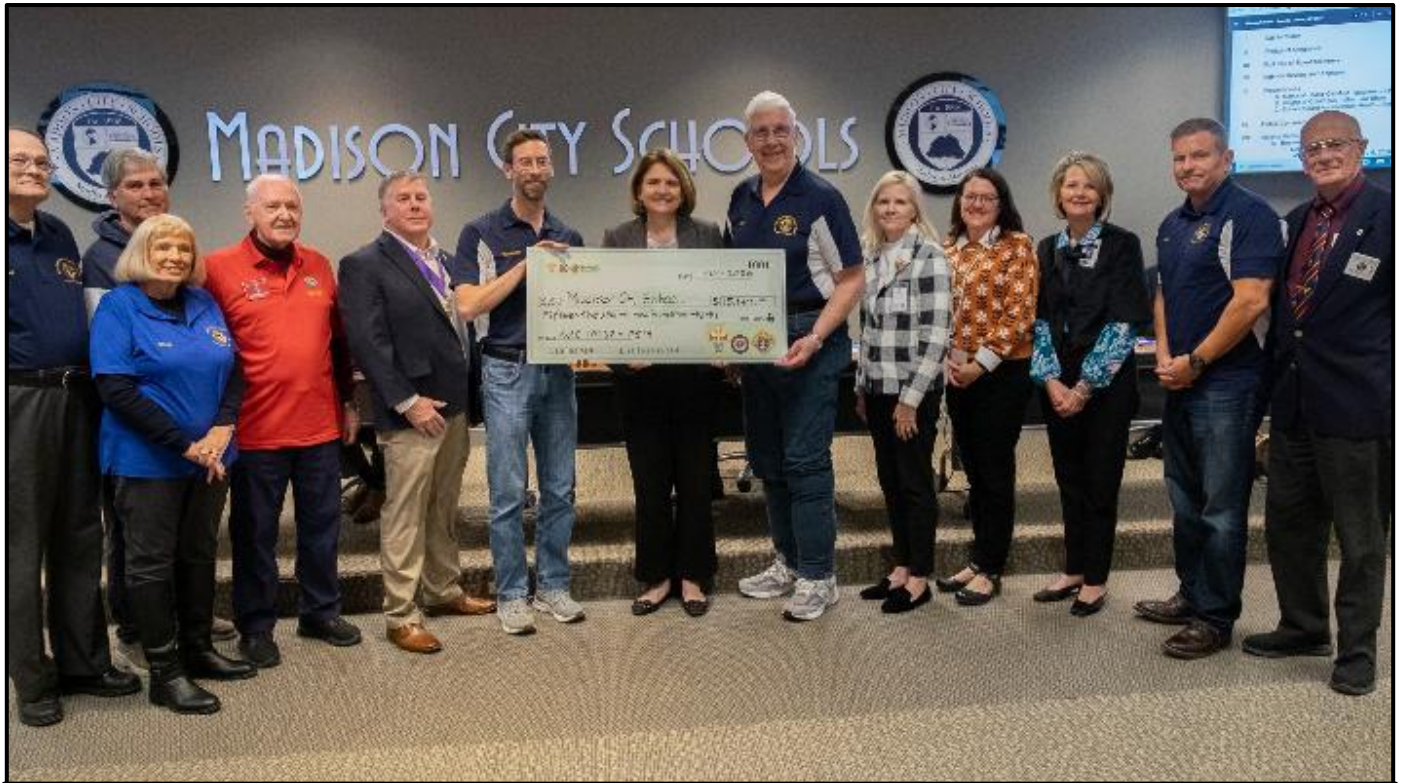
Knights of St John the Baptist and Merciful Jesus Councils, Ladies Auxiliary, and District 20 presented a $15,130 check to the Madison City School District on January 29 th for their Special Education Program