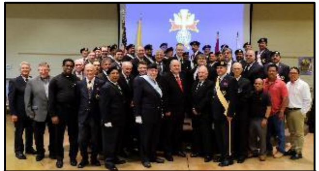
4th Degree Exemplification, 14 Jun 25, Madison, Alabama (Color Guard Team with New Sir Knights & Dignitaries)

See your Color Corps Commander, Faithful Navigator or Faithful Comptroller or details ASAP!