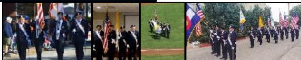
Become a Color Guard for Civic and Public Events