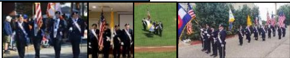
Become a Color Guard for Civic and Public Events