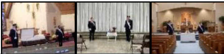
Become an Honor Guard for Funeral Masses and Visitations