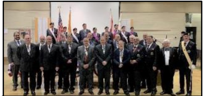
4th Degree Exemplification, 15 Apr 23, Madison, Alabama (Color Guard Team with New Sir Knights & Dignitaries)

29 Sep: Silver Rose Prayer Service, St. John's Day Chapel, 3:00 PM