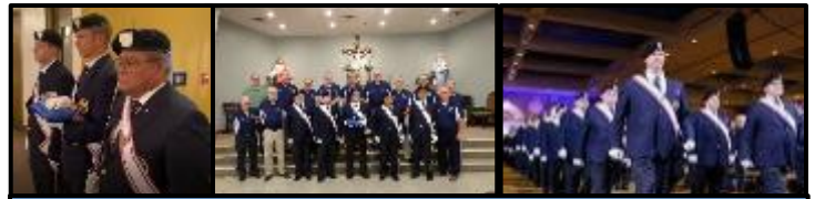
Become an Honor Guard for special Masses and events.