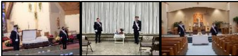
Become an Honor Guard for Funeral Masses and Visitations