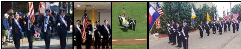
Become a Color Guard for Civic and Public Events