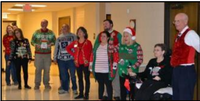
The "Ugly Sweater" Contestants