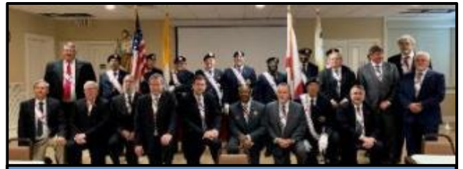
4th Degree Exemplification, 10 Sep 22, Florence, Alabama (Color Guard Team with New Sir Knights)