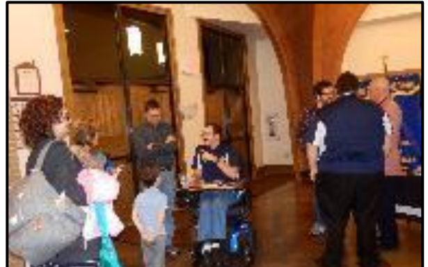
Meeting with prospective candidates