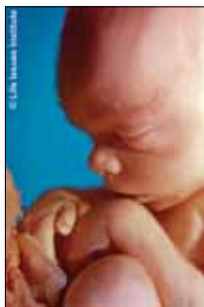
Human life 20 weeks from conception