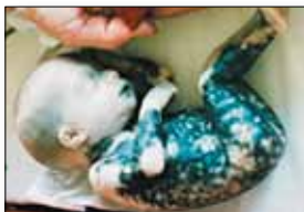
Saline abortion in the second trimester.

In a saline abortion, amniotic fluid is removed from the uterus and replaced with a saline solu-