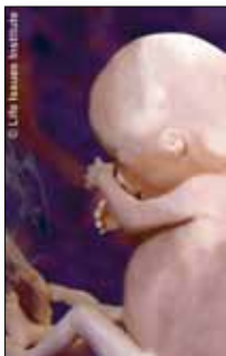
Human life 16 weeks from conception