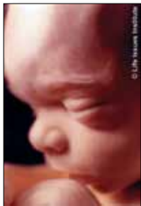
Human life 20 weeks from conception