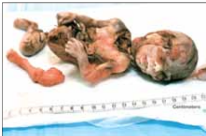
Abortion at 21 weeks