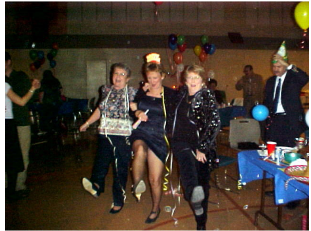
The Wild Bunch!