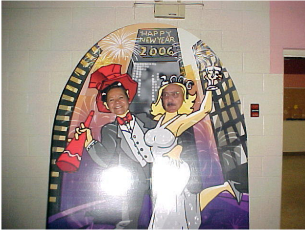
Who is the mustached woman?