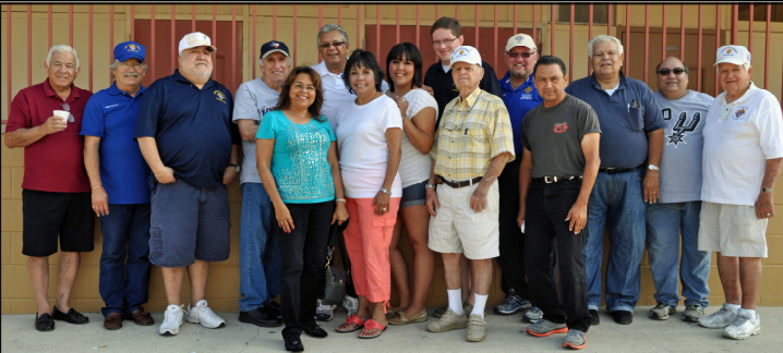
Annual Christmas in July (7/19/2014) St. Agnes Catholic Church Knights of Columbus Immaculate Conception Council 4140

That's where a personally-owned disability income insurance product, like Income Armor, comes into play. It can offer valuable income replacement in the event of an injury or illness.. If you have a job, you must know about this coverage.