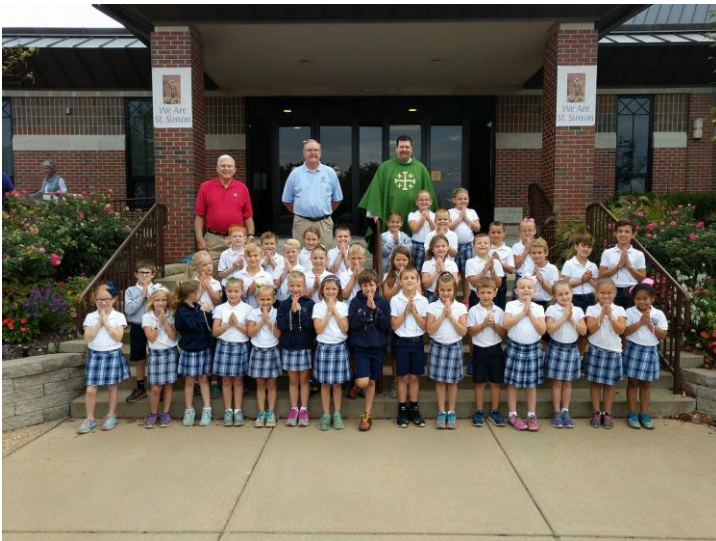
On October 3 rd the second graders received their rosaries.