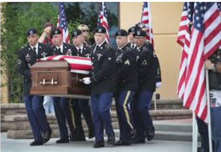
Leaving the church for the funeral