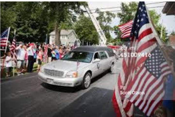
Coming home from Midway Airport