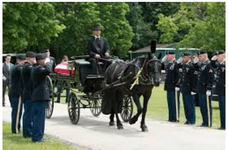
Arrival at St John's cemetery

The funeral procession to St John's Cemetery took over an hour to pass Front Street. Metra stopped all trains to permit the procession to travel freely.