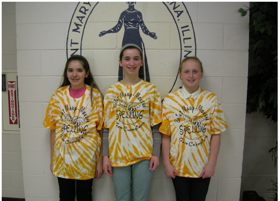
Winners of the 2014 Regional Spelling Bee