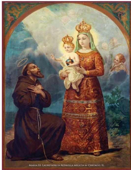
MARIA SS. LAURETANA of ALTAVILLA MILICIA IN CHICAGO, IL.

RELIGIOUS PROCESSION, SUN. 3 PM w/ the Traditional Flight of the Angels