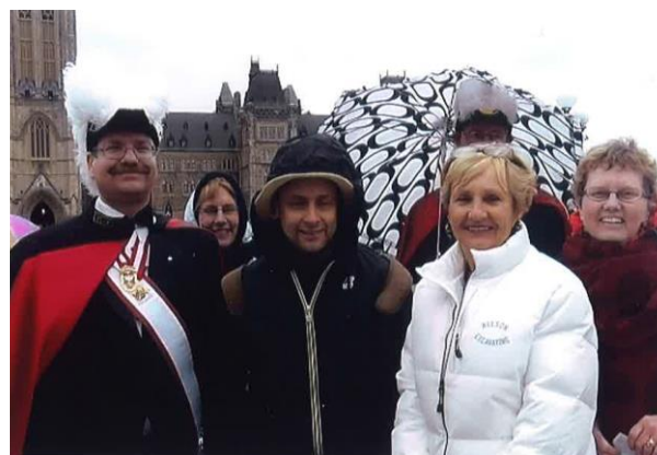
March for Life in Ottawa coming in May 2015

If anyone is considering a trip to Ottawa for this year's March for Life on May 13 th , 2015, car pools are being formed. Please discuss your needs at the next General Meeting with the Assembly's Executive.