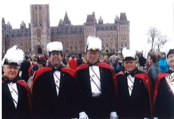
March for Life in Ottawa coming in May 2015