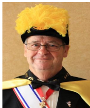
Master of the Western District of the Marquette Province of the Fourth Degree