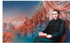
Fr. Michael J. McGinley 1832-1890 Founder of the Knights of Columbus