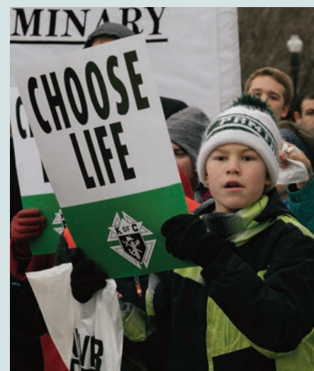
Spirit Juice Studios