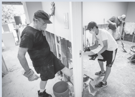
Knights from Our Lady of the Lake Council 9240 in Mandeville, La., remove water-damaged wallboard and flooring in one of their parish's rooms as part of a cleanup effort.

For more information on the award requirements, please visit kofc.org .