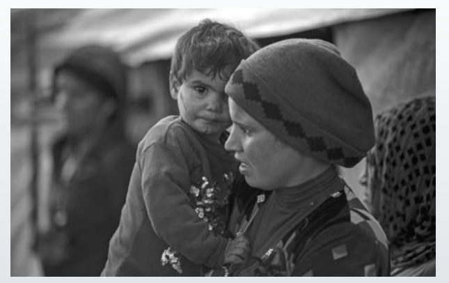
A young Syrian mother who was displaced by violence holds her 2-year-old child outside their tent at an informal settlement in Deir al-Ahmar, in Lebanon's Bekaa Valley.

The Knights of Columbus recently contributed almost $2 million to various aid programs in the Middle East that have received little to no funding from the U.S. government or international community since ISIS began its genocidal campaign against the region's religious minorities in 2014.