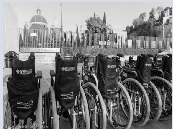
A row of wheelchairs just before a distribution in Mexico City, Feb. 22, 2016.

The Global Wheelchair Mission, a partnership of the American Wheelchair Mission and the Canadian Wheelchair Foundation, changes the lives of children and adults each day.