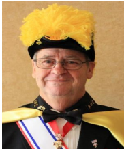
Master of the Western District of the Marquette Province of the Fourth Degree