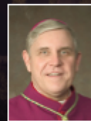
Archbishop Jerome Listecki