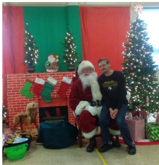
Fort Howard Council 5382 Breakfast with Santa

Knights from Msgr. Blecha Council #2055 marched and handed out tootsie rolls in the Menomonie Winterdaze parade on December 14 th . They built a float featuring a nativity scene and the message "Keep Christ in Christmas". It was a great way to get rid of our extra KC tootsie rolls and bring more awareness of our council to the local community!