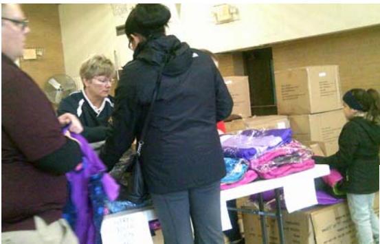
Knights of Columbus Coats for Kids - Racine