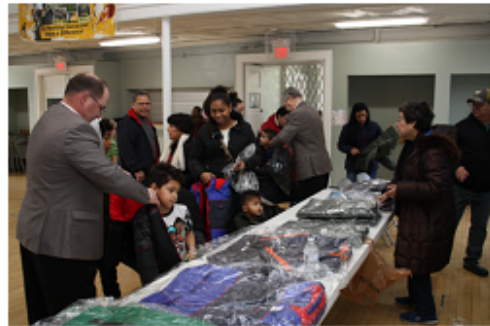
Our Lady of Guadalupe Council 6719