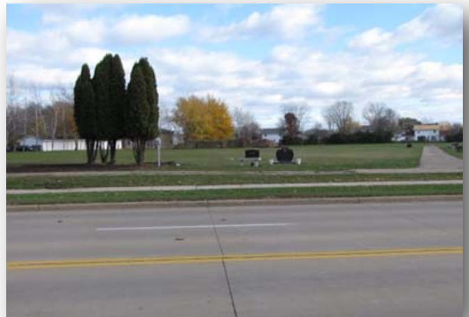
Calvary Cemetery Hwy. 45 Oshkosh, WI Council #614 Oshkosh