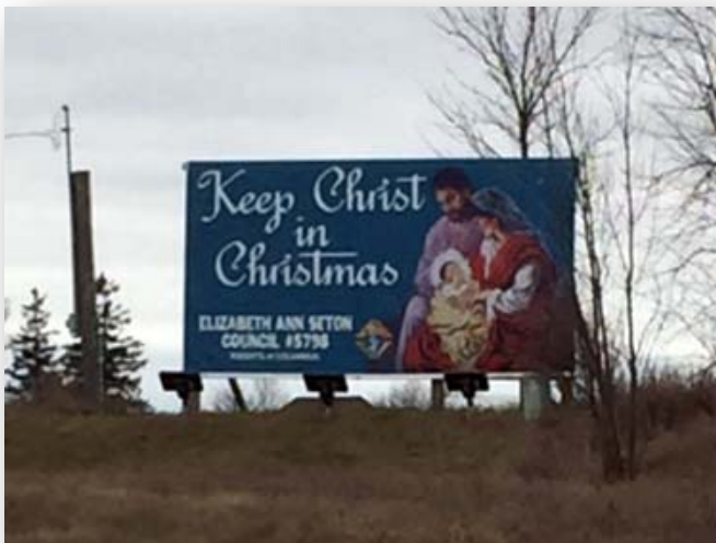
Elizabeth Ann Seton Council #5798, Reedsville annual billboard reminder to "Keep Christ in Christmas"