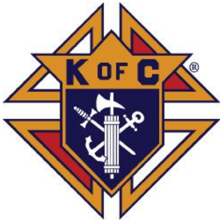
SK Bernie Iwasczyszyn Council 9102 Grand Knight