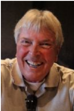
State Membership Director