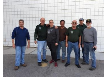
Community outreach program – delivering food to Title 1 School.