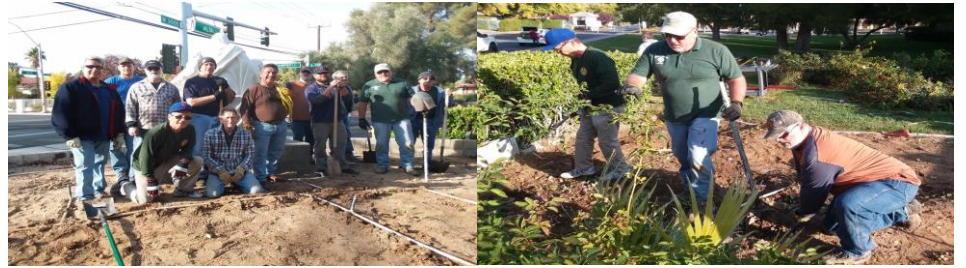
Landscaping project for OLLV.