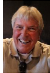
State Retention Director