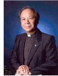
Nevada State Chaplain