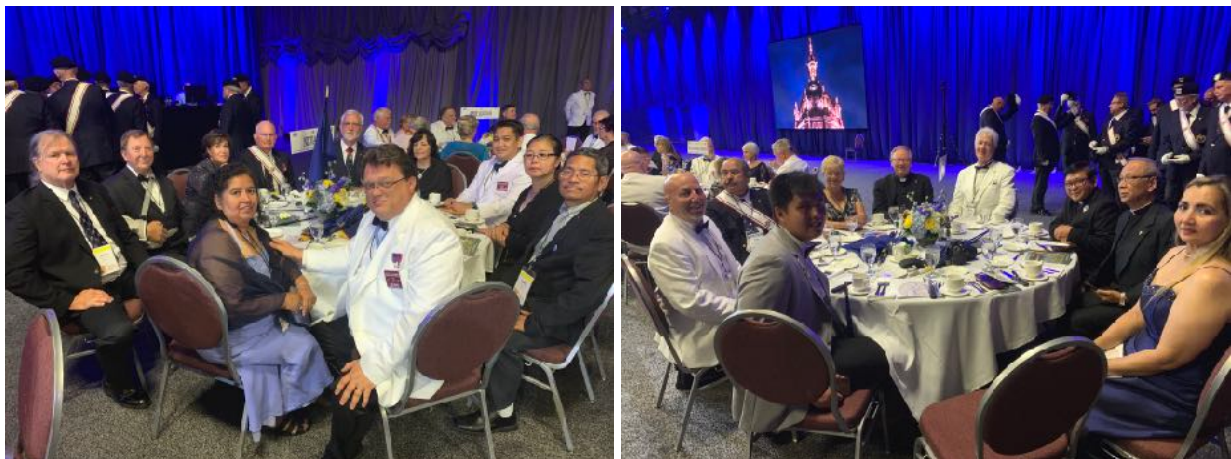
Photo shows Nevada State Council Delegates, attendees and families during the State Dinner