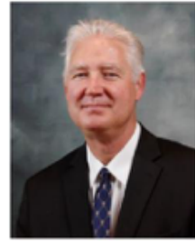
Immediate Past State Deputy

Congratulations to the July 2019 Nevada Families of the Month selected by Supreme.