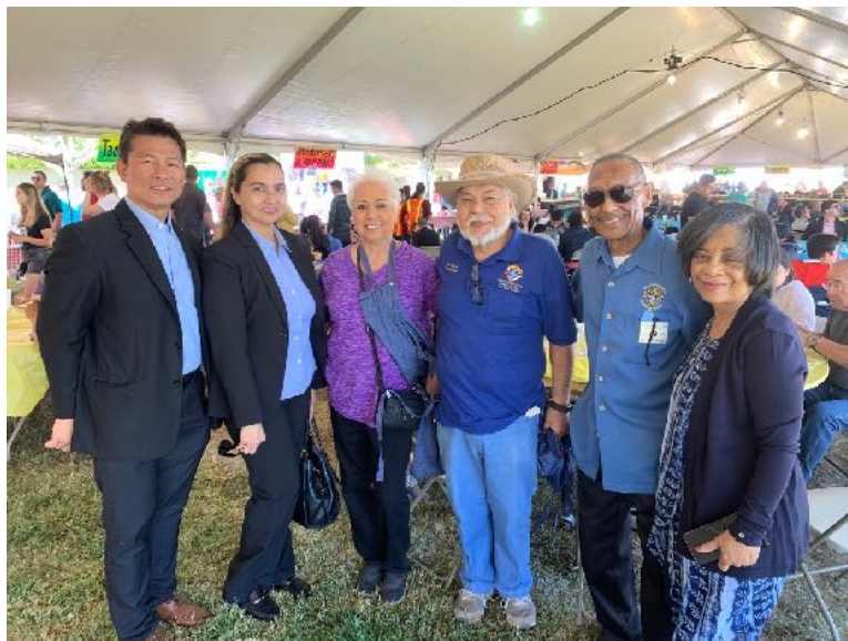
St Francis de Sales Parish Festival, Las Vegas