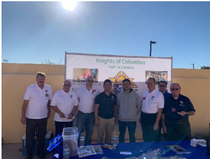
Holy Spirit Council 14784 Church Drive