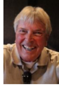
State Retention Director