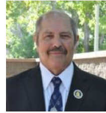
State Warden State Membership Director