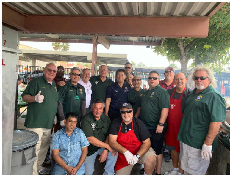
St Jude Council 9102 Knights in Action at Harvest Festival at Our Lady of Las Vegas Catholic Church