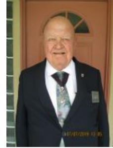
Soccer Challenge Chairman