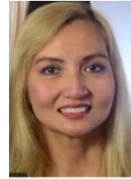
2021 Nevada State Council Convention Chairperson