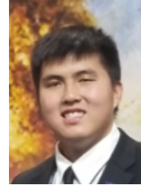
Nevada Young Adult Chairman