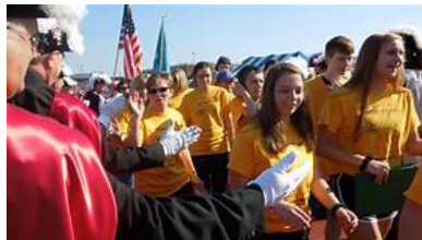
Participation in the Special Olympics

More images for Photos of The Knights of Columbus Charitable Work