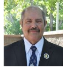
State Warden State Online Membership Coordinator