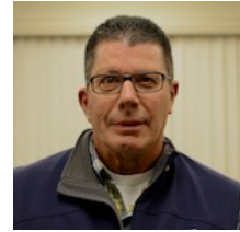
Grand Knight. Council #12845