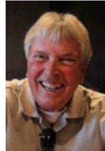
State Recruitment Chairman

Vivat Jesus! From what I have seen: THIS HAS BEEN A GREAT YEAR! We have met our goals. We have replaced those who have died. We will miss them; they were the “Light of Christ”. Now we have many new members; some of them are youngish. Yeah! Now WE need to get them involved.