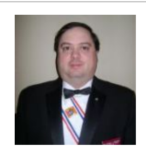
Special Olympics & Intellectual Disabilities State Chairman

WHAT: The State of Nevada Knights of Columbus' Campaign