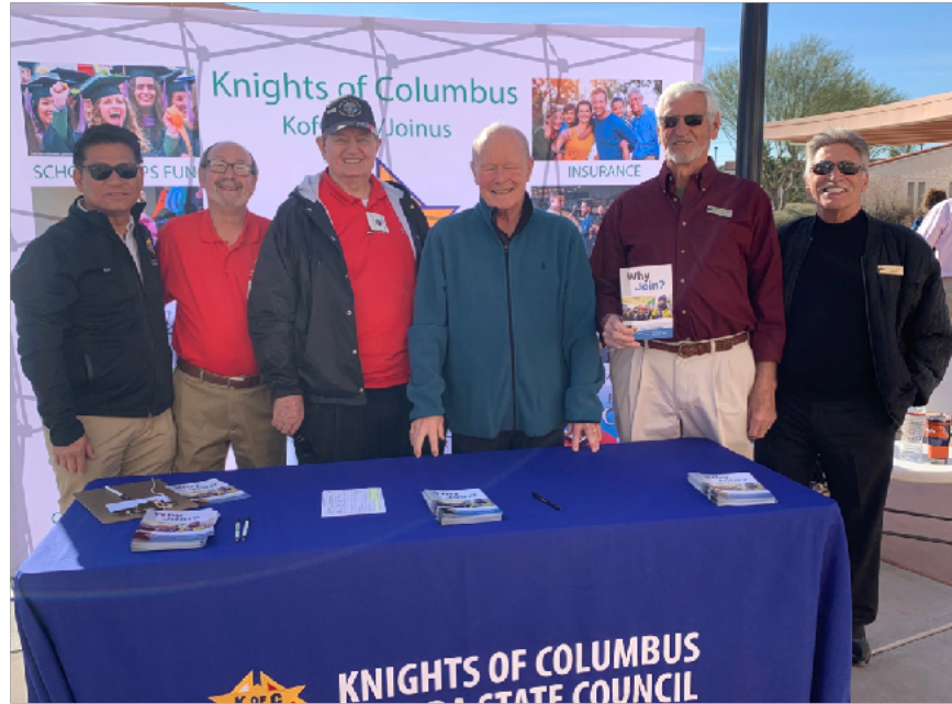
St Viator Council 8282 Delta Church Drive