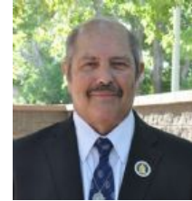
State Warden State Membership Director