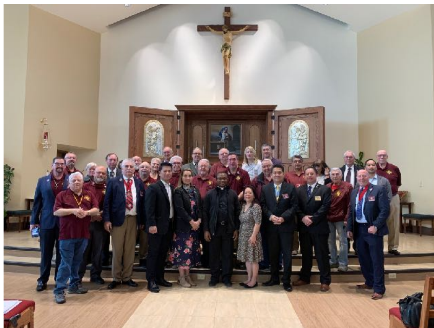
Renewal of Vows, followed by Degrees Exemplification hosted by St Anthony of Padua Council 14544