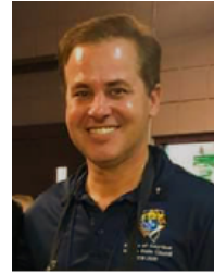
State Public Relations Chairman