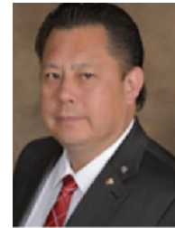
Convention Yearbook Chairman