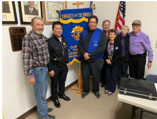
Pahrump Council 10780 Meeting Photo with Pahrump Council 10780 Officers and Ladies Auxiliary