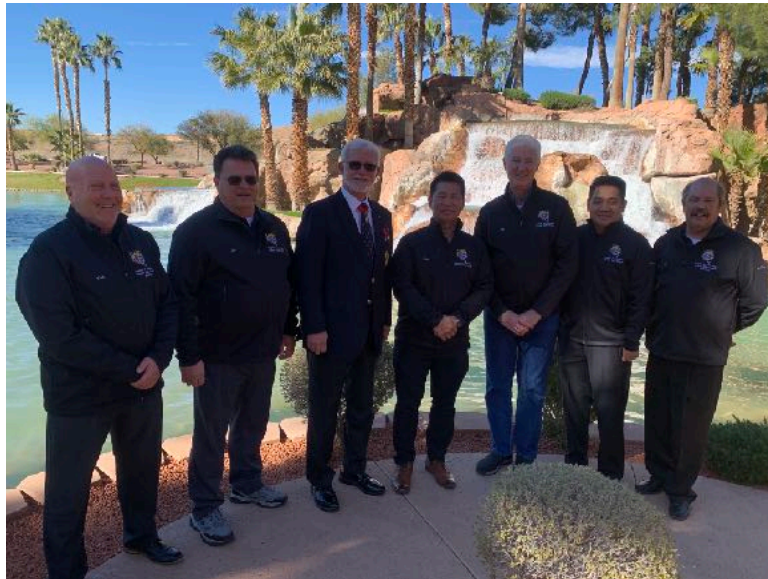
State Officers February, 2020 Planning Meeting at Mesquite