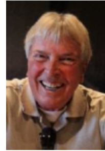
State Retention Director