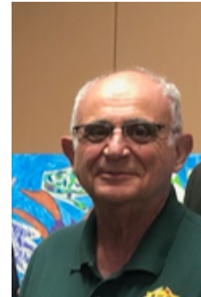
Blood Drive Chair

I want to thank you and the Knights for your support over the holiday weekend. During the Memorial Day weekend we saw that the usage of blood products was outpacing our blood collections. We over the weekend more than 43,000 people were expected to be injured due to travel. You have helped to keep our city safer and helped us to meet the needs of patients in our community. As a thank you all donors will get enough points to redeem on our website a $10 Amazon or Fandango gift card. Listed below are your results.