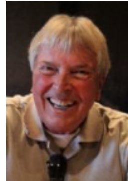
State Membership Director

HAPPY FATHERS' DAY, Brother Knights! We pray all Fathers will be Blessed not just on this dedicated day but always. Dads are examples for their children in all aspects of life. We are blessed to have inspirational dads. Pray for them and US this month and always.