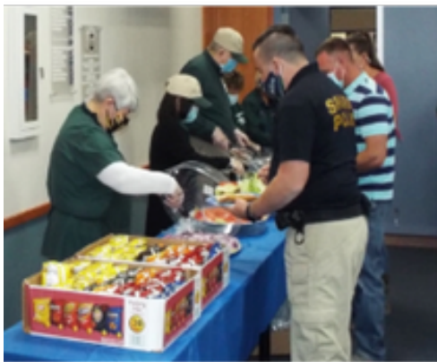
Grill it and they will come