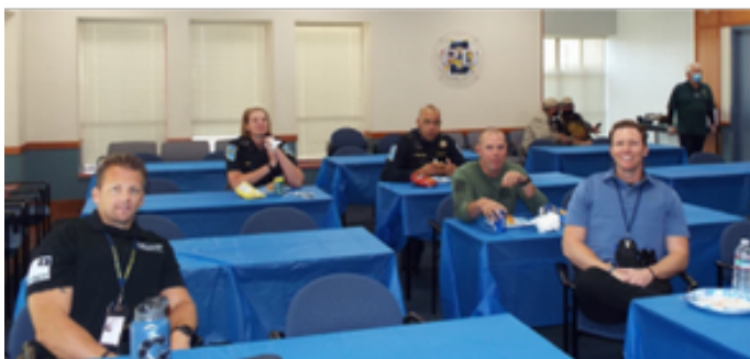
Honorees socially-distanced. A sign of the times. Smiles.