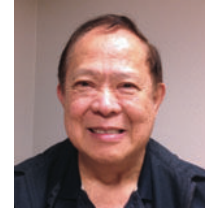
State Family Program Director