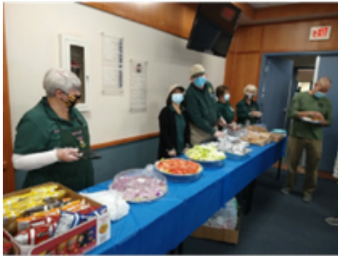
Serving line prepared for honored guest arrivals