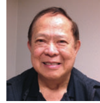
State Family Program Director