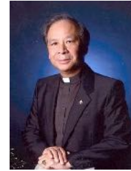
Nevada State Chaplain