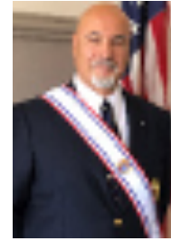
State Retention Director

When generating Notices, the pending assessments are processed, the First Notice is generated from the “Notices” section of the Print Center in Member Billing. You have the option of mailing or emailing the notices. This is a good opportunity to include a personal note from the Grand Knight letting its members know that we may have Brother Knights that could be struggling during this pandemic, and we should reach out to those Brothers in need and assist them.