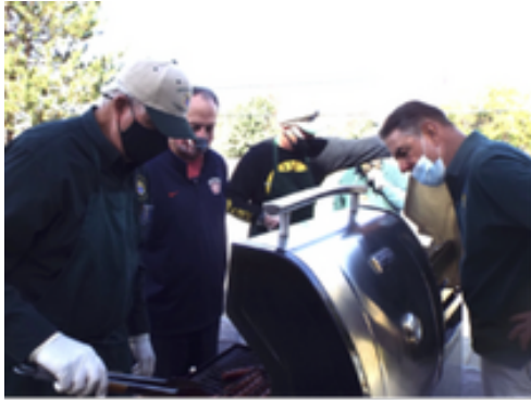
Making sure each hot dog is cooked to perfection