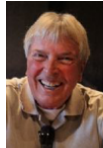
State Recruitment Chairman