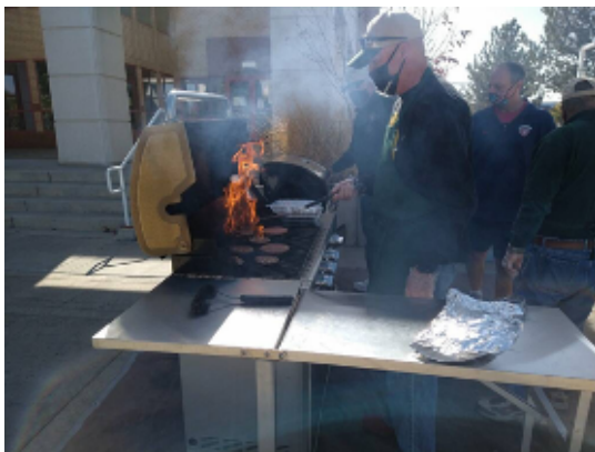
A Knight with a flare (up) for cooking

This event was not a planned Council-budgeted line item. All funding came from Council members who just wanted to reach out to law enforcement to say "thank you" for what they mean to our community every day. The event was very well-received. Ponderosa 4928 got its mojo back!