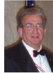
Nevada Webmaster and Communications Director

During these pandemic days when Councils are meeting online I suspect most Officers are having a hard time coming up with nominations for either the Family or Knight of the Month. Clearly, we do not have the same level of activities making it difficult.