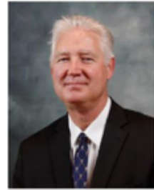
Immediate Past State Deputy