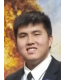
Nevada Young Adult Chairman