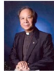
Nevada State Chaplain