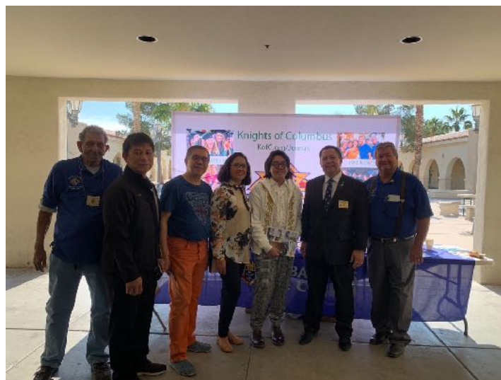
Prince of Peace Council 9899 Delta Church Drive