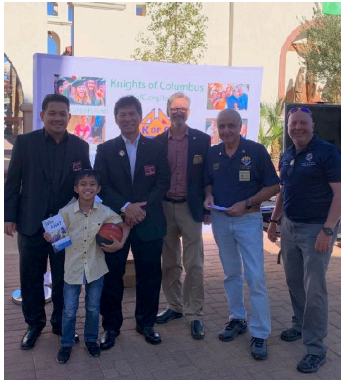
St Joseph Husband of Mary Council 10442 Delta Church Drive