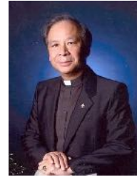
Nevada State Chaplain