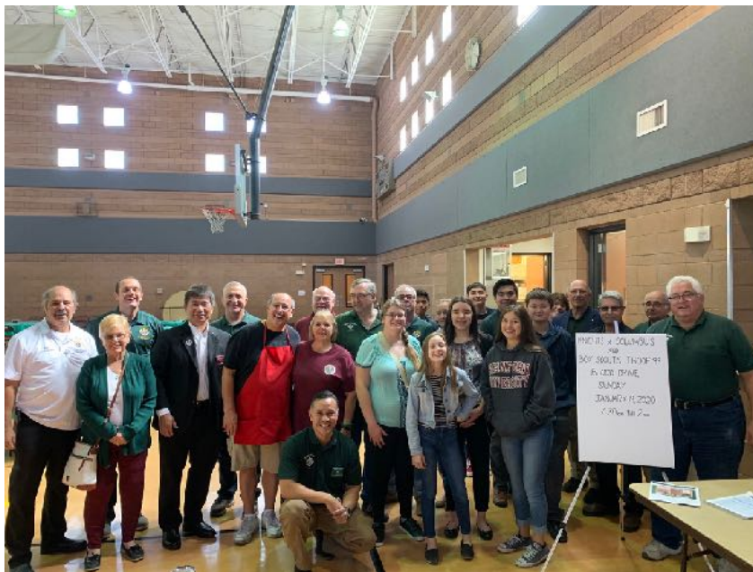
St Jude Council 9102 Pancake Breakfast and Membership Drive