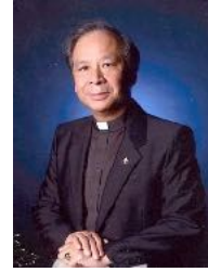
Nevada State Chaplain