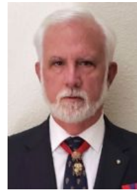
NV District Master