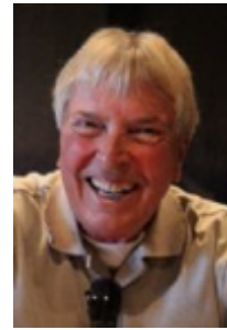
2018/2019 State Retention Director