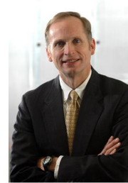
Senior Vice President – Membership & Fraternal Mission