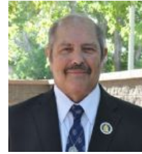
State Warden State Membership