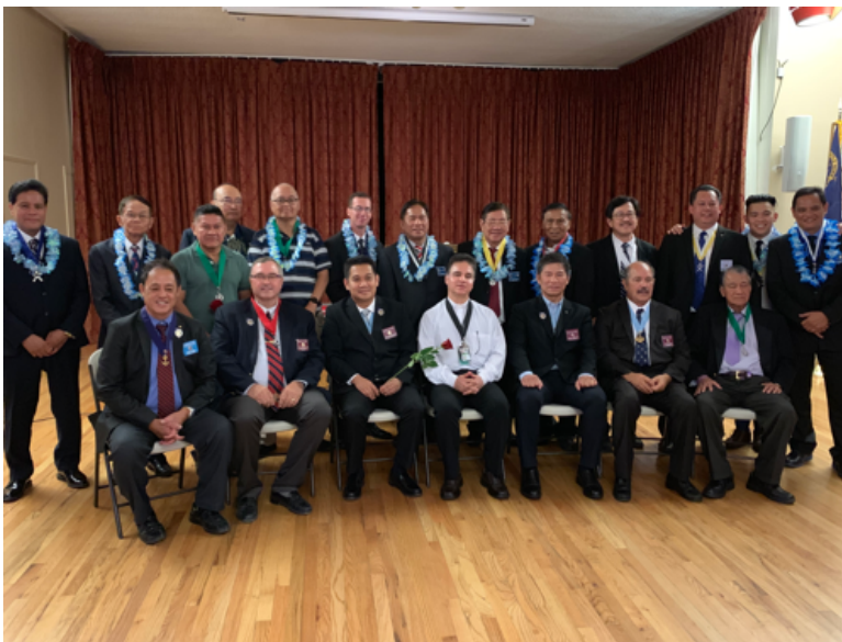
Photo shows State Officers and District Deputies after Installation Ceremony held at Immaculate Conception Catholic Church in Sparks.