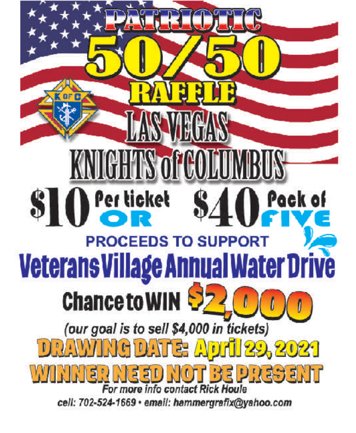
Faithful Pilot. Assembly 3772