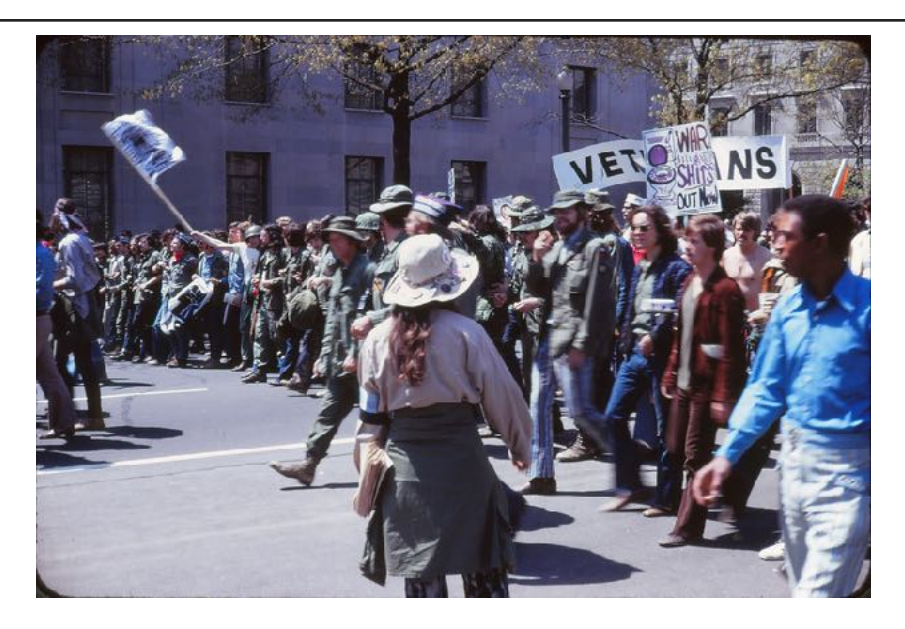
LET US STAY VIGILANT IN PROTECTING OUR RIGHT TO FREE SPEECH UNDER THE CONSTITUTION.

4) We should defend laws that are intended to benefits the common good. This brings to mind the case of Jackson vs. Massachusetts where the court upheld A mandatory vaccine law in 1905 over the objection of a man who claimed it violated his due process. Justice Alito conceded that he is all in favor of preventing dangerous things from issuing out of Cambridge, Massachusetts and infecting the rest of the world.