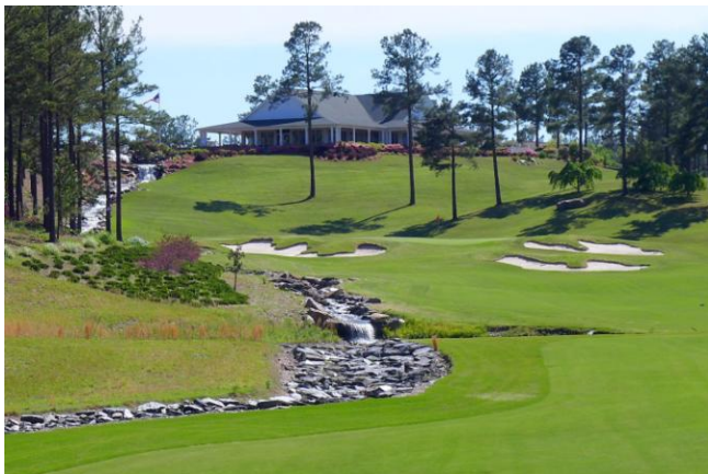
From the fairway of #18 finishing hole on Granada. What a view!!!!

--- All proceeds will go to the Seminarian House of Formation in Little Rock ---