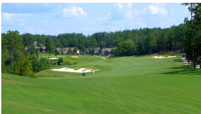
Looking toward the green of par 5 #15