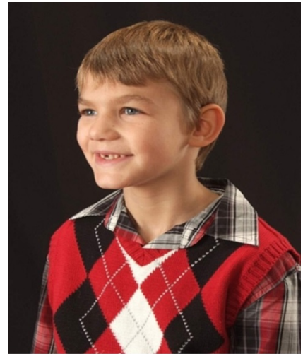
PORTRAIT INNOVATIONS Professional Studios portraits.com