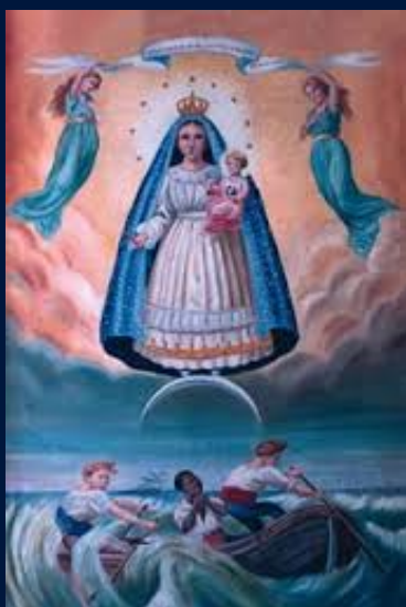
Our Lady of Charity