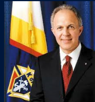
Carl A. Anderson Supreme Knight

“We have a moral Obligation to invite every eligible Catholic man to join the Knights of Columbus.”