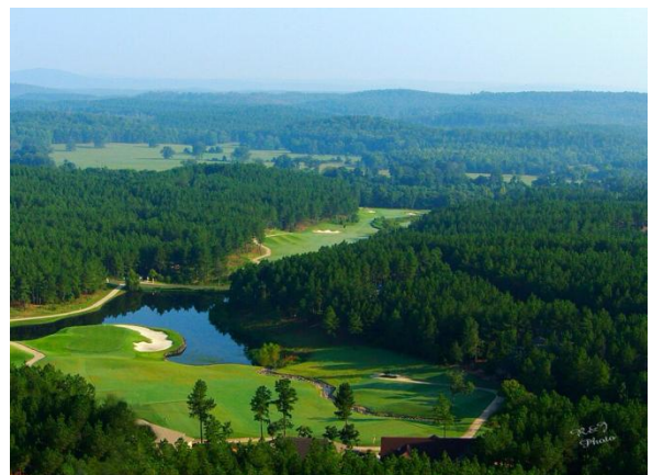
Looking down from above the 11th hole w/ #12 in the distance