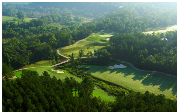
Aerial view of hole #12 green and #13 tee box and green