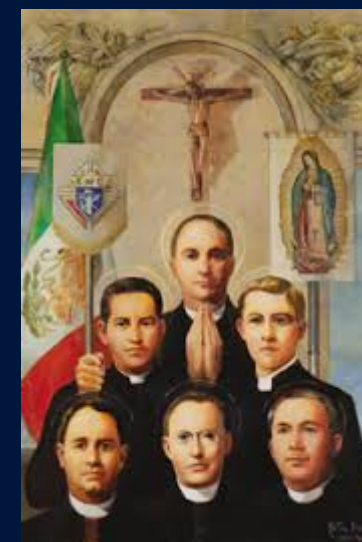
The Mexican Martyrs