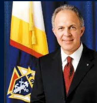
Carl A. Anderson Supreme Knight

“We have a moral Obligation to invite every eligible Catholic man to join the Knights of Columbus.”