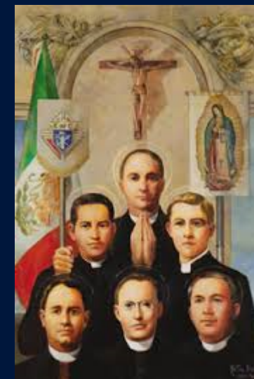
The Mexican Martyrs