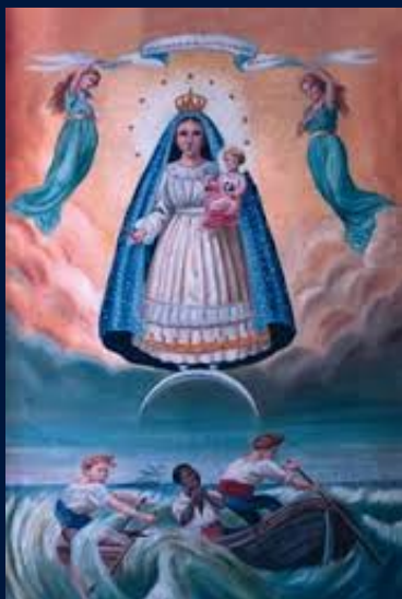
Our Lady of Charity