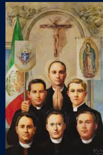
The Mexican Martyrs