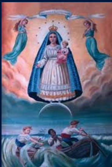
Our Lady of Charity