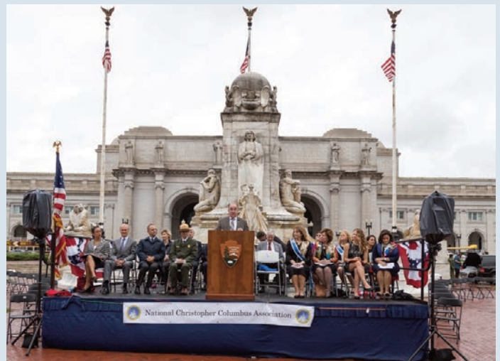
On Columbus Day, Oct. 9, Fourth Degree Knights from Virginia, Maryland, the District of Columbia and surrounding areas honored Christopher Columbus at a wreath-laying ceremony held in Washington, D.C. The event took place at the explorer's memorial fountain, which was dedicated in 1908 and established in great part through the efforts of the Knights of Columbus.

Gene Kranz, longtime NASA flight director and leader of the mission control team that saved the crew of Apollo 13, was one of the many people whose home was severely damaged by Hurricane Harvey. In a new video on the Supreme Council's YouTube channel, www.youtube.com/knightsofcolumbus , Kranz describes how the Knights delivered aid and inspiration to the hurricane victims. Every Knight should watch this video and consider using it at his council's next recruitment event, as it speaks so accurately about what it means to be a Knight of Columbus.