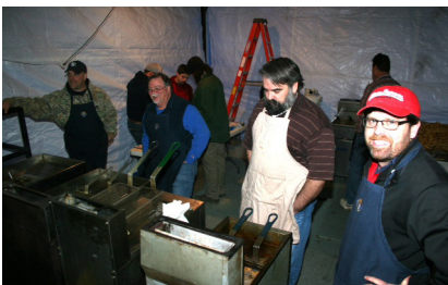
World famous cooks!!